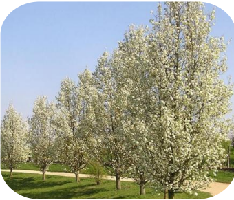
Pyrus calleryana capital Capital flowering pear