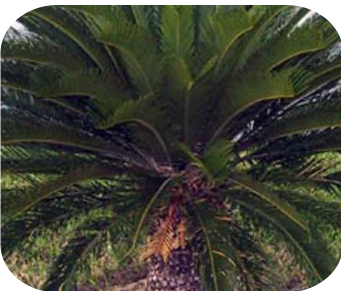
Cycas revoluta Cycad